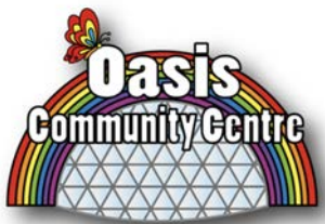
Oasis Community Centre (RCN: 1052626)